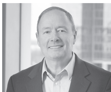
General (Ret.) Keith B. Alexander

Other current public company boards: None