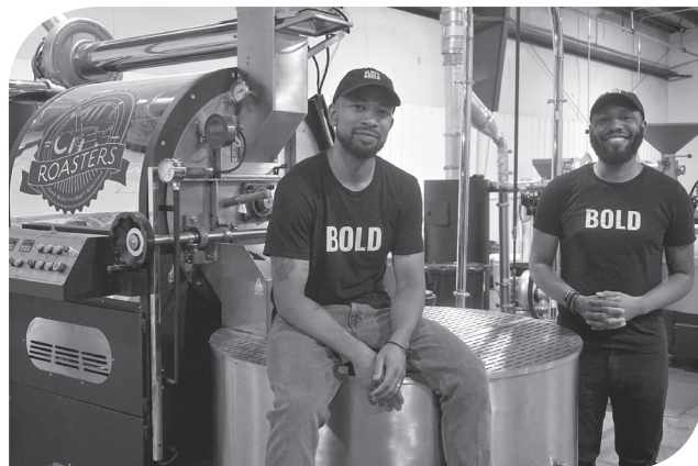
Iowa small business BLK & Bold prepares specialty coffee and tea for sale on Amazon.

Learn more at aboutamazon.com/impact/empowerment/small-businesses .