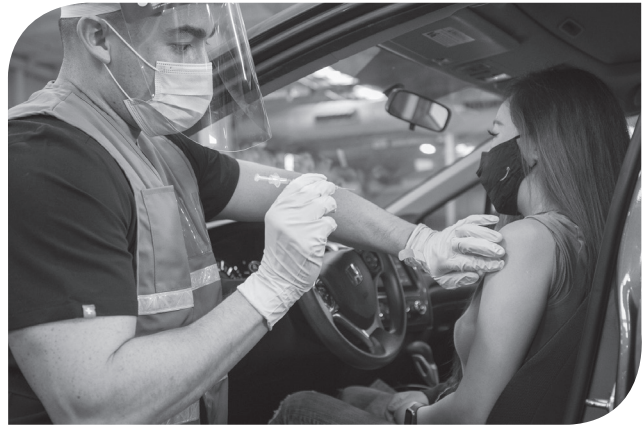
A front-line employee from Amazon's pharmacy fulfillment center in Arizona receiving a COVID-19 vaccination.

We believe our future is diverse, inclusive, and accessible across every color, gender, belief, origin, and community. We're constantly learning and innovating—and our long-term efforts in diversity, equity, and inclusion are no different, including: