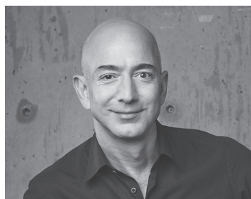
Jeffrey P. Bezos