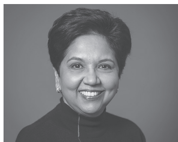
Indra K. Nooyi

Other current public company boards: None