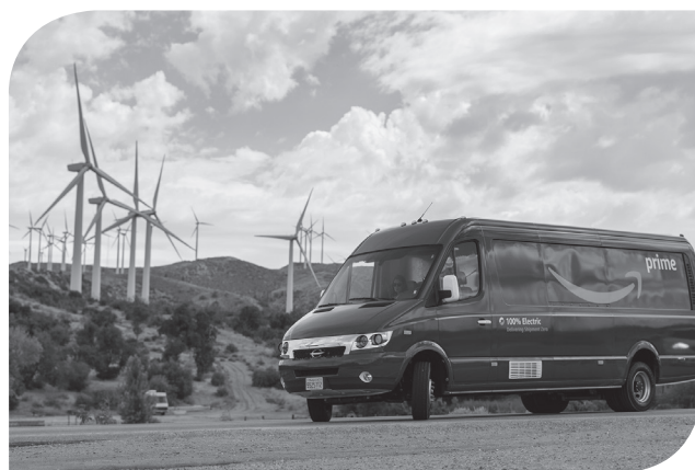
An Amazon electric delivery vehicle passes a windfarm outside of Los Angeles.

Learn more at sustainability.aboutamazon.com .