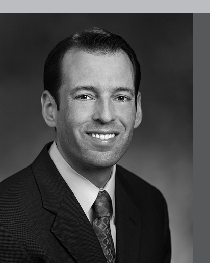
THE HONORABLE ANDY BILLIG Washington State Senate, District 3