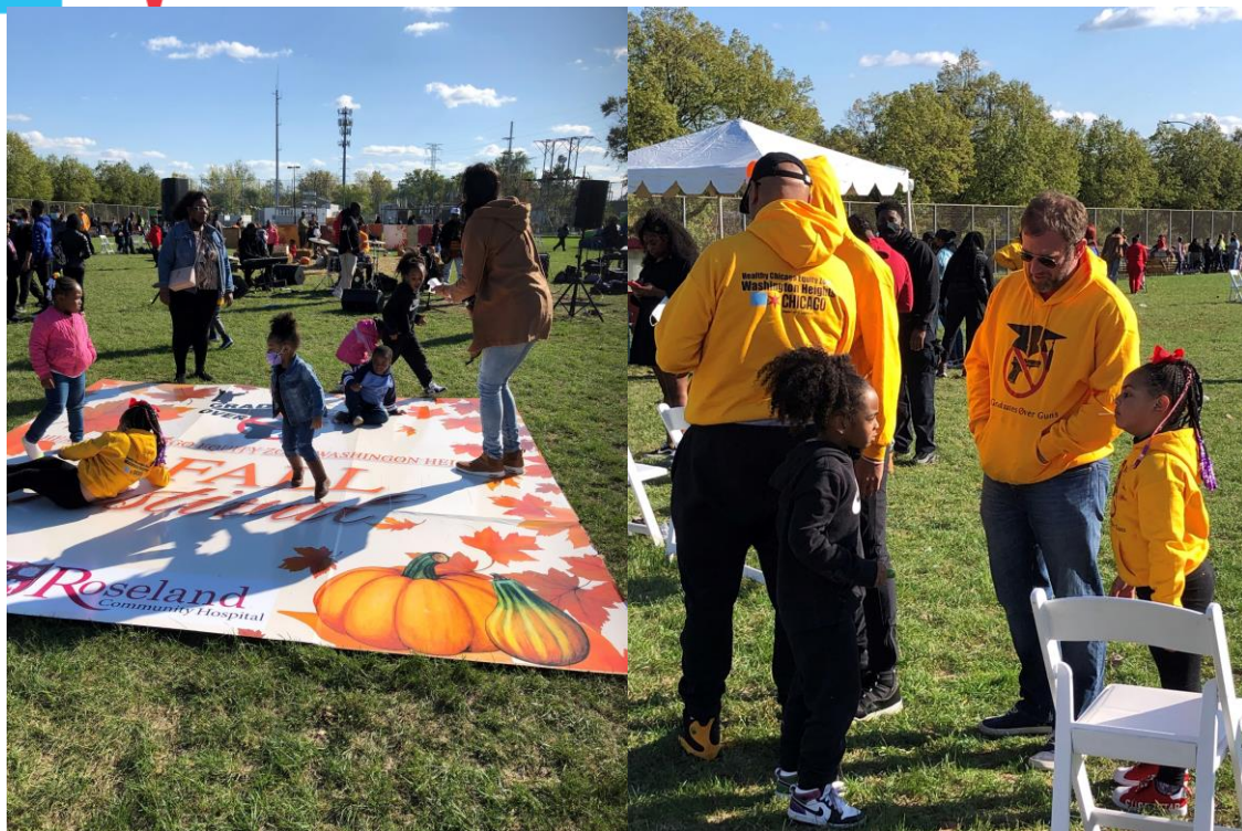
Community lead Graduates over Guns Fall Festival and Winter Wonderland Events