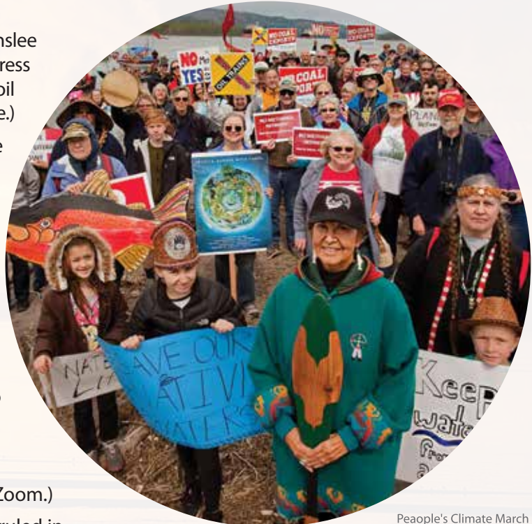
Peaople's Climate March

MILES: We won in court again! A federal judge ruled in favor of our coalition! The federal government must redo its environmental review for the refinery and pipeline to consider the full climate impact.