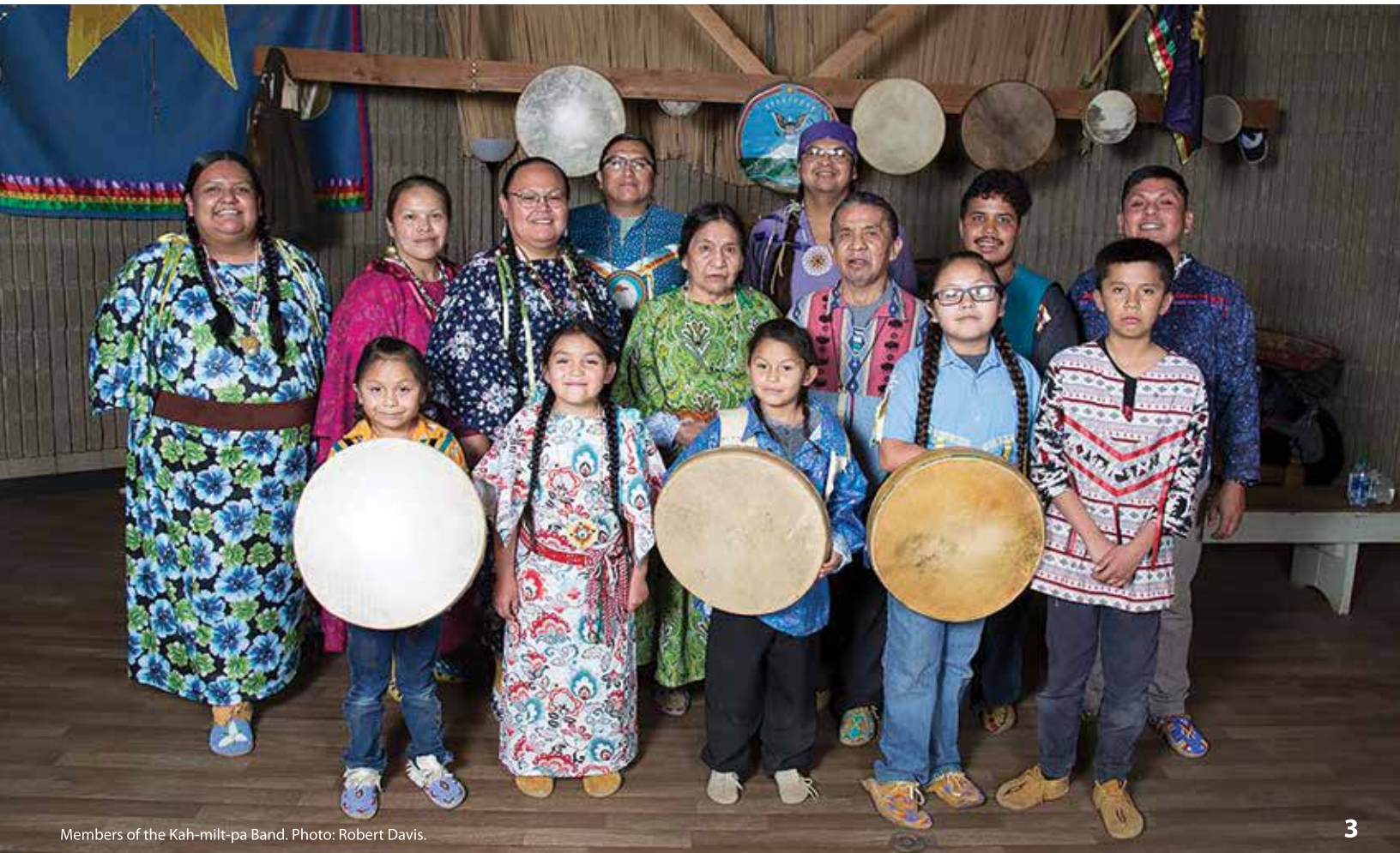
Members of the Kah-milt-pa Band.

Driving down I-84 on the Oregon side or SR-14 on the Washington side, you probably wouldn't even notice the place we're talking about. Sure, you'd see the John Day Dam, stretching across the Columbia River collecting its toll. Maybe you would notice some remnants of the old aluminum smelter site, though certainly not the contamination leached into the ground. If you were particularly astute one day, the wind turbines in the distance, sunlight glinting off of their rotating white blades, might catch your eye. Or perhaps the new pumped storage project, proposed by Rye Development and proclaiming in neon letters, GREEN DEVELOPMENT & JOBS, rattles through your mind. But by this time you have driven past the place, not even seeing the land, just what decades of development have left behind. What a shame to miss this sacred place.