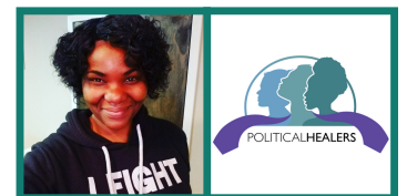
MICH PURDUE LOVEGOOD POLITICAL HEALERS PROJECT