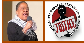
JARIBU HILL MISSISSIPPI WORKER'S CENTER