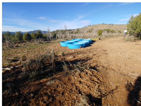
Damage around water source, Mud and Cane allotment 11/2/2021